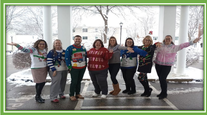
Pretty Sweater Theme Day